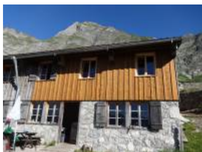
HL Chalet Paray-1