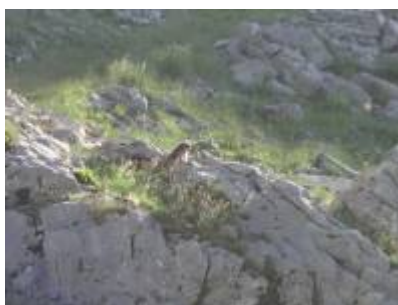
HL Marmotte Paray