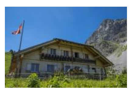
EPW Paysage chalet ruble

The chalet burned down in 2001 and was only rebuilt in 2003.