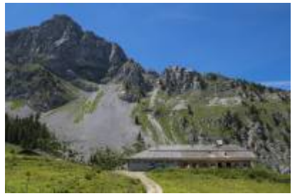
EPW Paysage chalet ruble 2