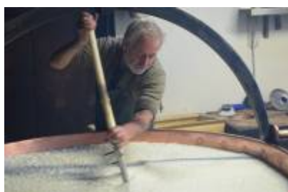
TF Brassage lait dans chaudron

Find out about the Tena family on the blog "histoires d'alpage" provided by Fromage d'alpage.