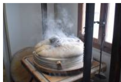
TF fromage sous presse